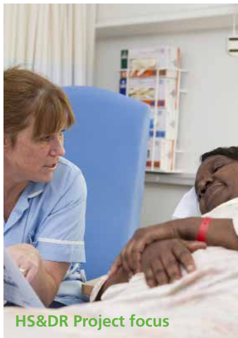
HS&DR Project focus

Eligibility and funding information is printed on the back cover of this leaflet. However, applicants should always check the programme website and call specification documents for full details of eligibility requirements.